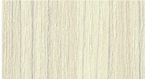
Arctic Groovz / AuthenTICK