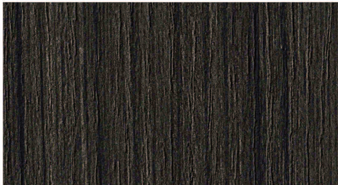
Licorice Groovz / AuthenTICK