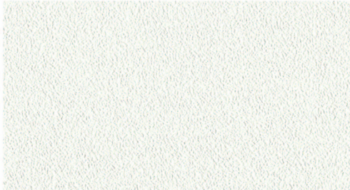
White / Suede