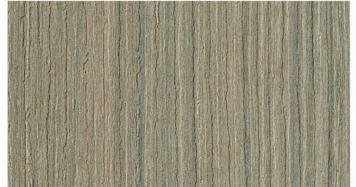
Aria / Medina